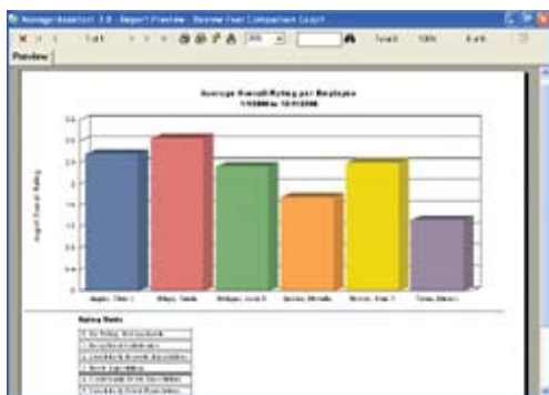
Clear and precise reporting