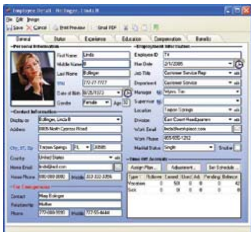
Comprehensive employee information